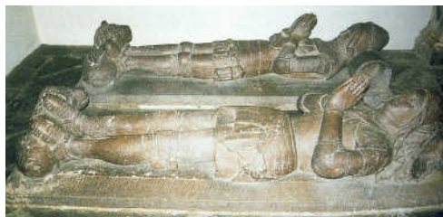
Roger and Edmund Mortimer*

A memorial of two mediaeval knights in St Nicholas's Church, Montgomery, one of which might represent Sir Edmund Mortimer, who had served as Constable of Montgomery Castle. After his defeat at the battle of Pilleth, Edmund became Owain Glyndwr's son-in-law when he married Catrin Glyndwr. Edmund died during the long seige of Harlech Castle in 1409.